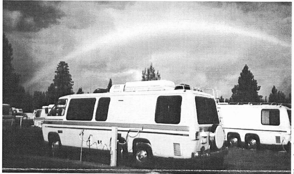
A brilliant rainbow wreathed the Sisters rally as storms crowded around the area.