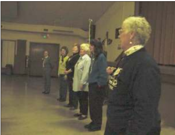
Six new recruits for the chorus line!