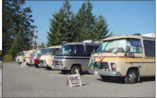
Impressive line of classics

village of Airstreams. When Cascaders leave their classics, and do a stroll around the area, they find about a 150 homes and bungalows, each with space for their owner's Airstream. Yes, you have to own an Airstream to live there. I talked to an older gentleman who lived in one of the bungalows, and he proudly filled me in on this huge clubhouse. He said it was hard for their club to come up with the initial money for everything, and with