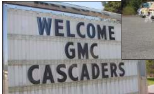
Nice to see our name in print!

For those of you who were not there, you missed the opportunity to see what someone's vision of the future held. Back in the 60's when Olympia WA was little more than the Capitol and a cluster of government buildings, a group of individuals struck out and bought some 200 acres in the middle of nowhere, just outside Olympia and stated, "we will build it here!" What they built was a clubhouse that can seat 500 for dinner, has full commercial kitchens, recreation facilities where pool and ping pong can be played and parking for over 200 RV's. That group of visionaries established a place where they could park and play in the great Northwest. What is a Land Yacht you ask? A classic aluminum trailer, brassy and sassy known as an Airstream! Here you will find not only a home away from home but a