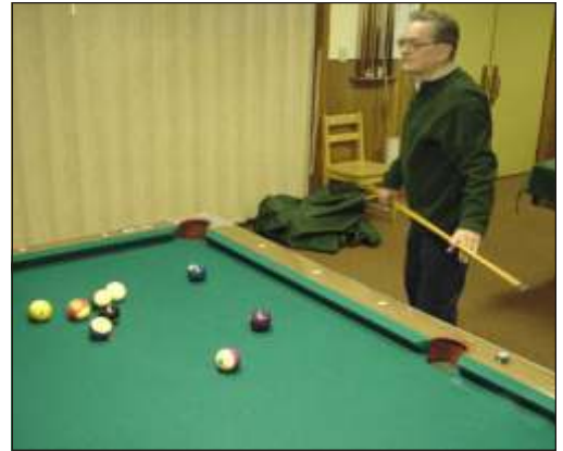
Snooker Ransom going for the kill!