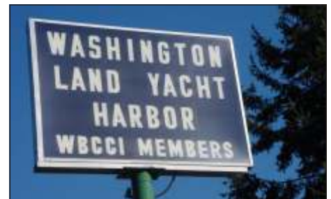
Our Rally home in Olympia, WA

volunteer help, they built their clubhouse for $42,000 in the 60's.