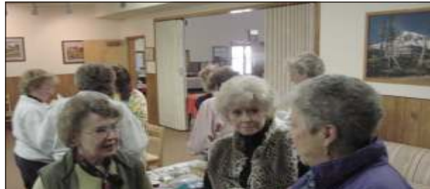
Looks like serious issues to me!