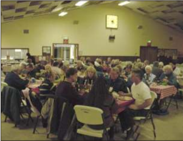
Settling into a great "pot Luck" dinner