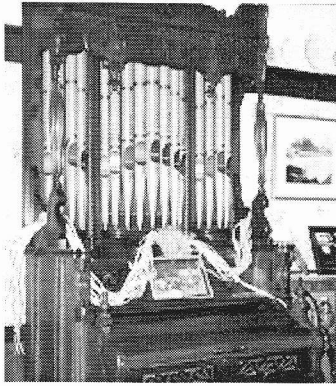
The historic Tokeland Hotel enjoys a resurgence of usefulness. Antiques fill the lobby including the elaborate pump organ at the left.