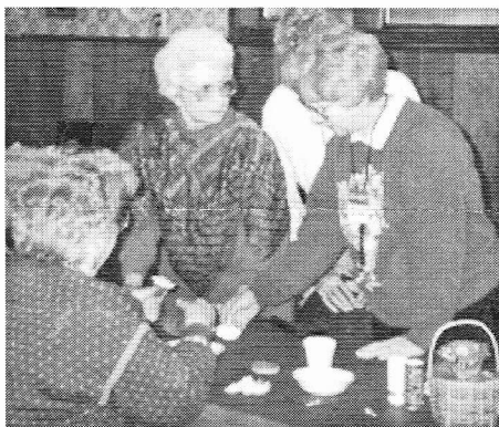
Several dozen paper-cast medallions went home from the rally. The park's crackling wood stove offered an ideal spot to dry the moist paper pulp fast. Dazzling white designs then pulled free from the molds.

The GMC Cascader News is published six times annually. GMC coach owners interested in membership should contact any officer for information.