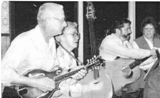
No-class Blue Grass musicians brightened our evening with considerable talent and a wide variety of selections.