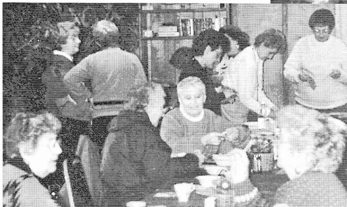
Paper casting

For paper casters seeking sources of supply for stamps or linter paper, the following address and phone numbers may be helpful: Rycraft, Inc., 4205 SW 53rd St., Corvallis, OR 97333 Phone: 503-753-6707 • Fax: 503-757-0367