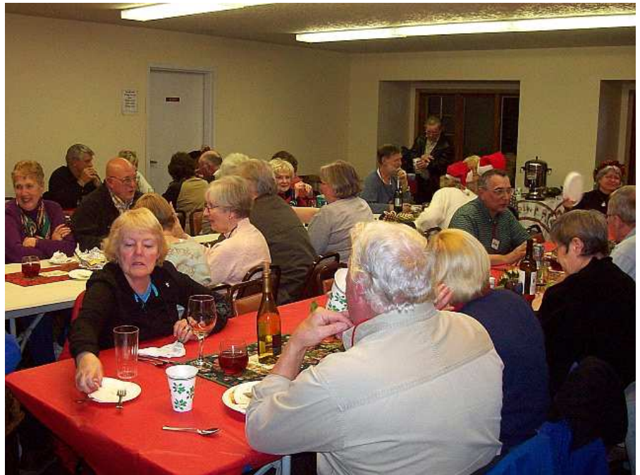
Dinner in the Club House

After the dinner, we boarded our motorcoaches and went into Cannon Beach to see the play, She Loves Me which was based on the movie "You've Got Mail".